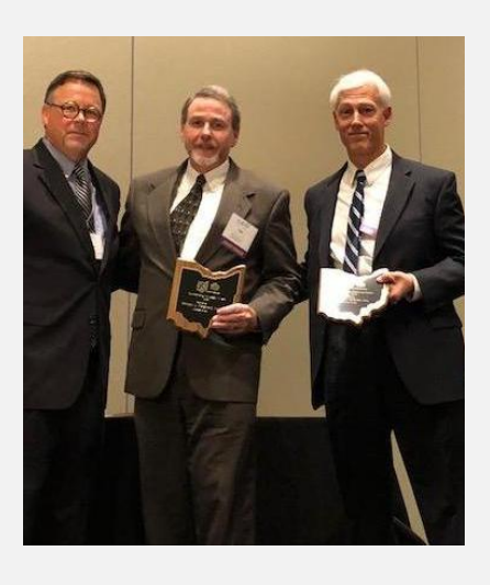
received the Outstanding Advocacy Award.